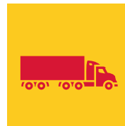
UK ROAD TRANSIT